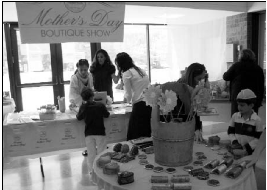
Enjoying the boutique

gling over who would get the last one of an item, true to our Syrian roots, one announced, "I'll pay extra for it!"